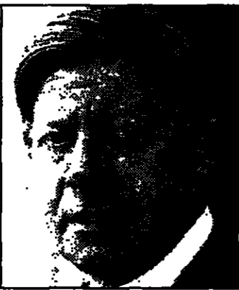
Helmut Schmidt, an officer in the Luftwaffe and later a German chancellor, had a Jewish grandfather.